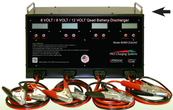
← Quad Battery Discharger BD6812QUAD

After one (1) year, nearly 90% of the batteries recovered through the BMP were still in service.