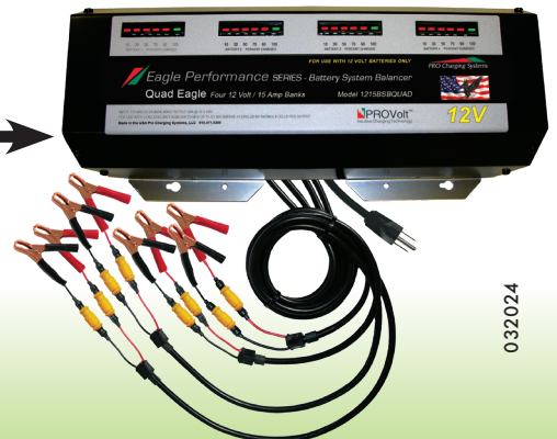
Battery System Balancer → i615BSBQUAD (6V) i815BSBQUAD (8V) i1215BSBQUAD (12V)